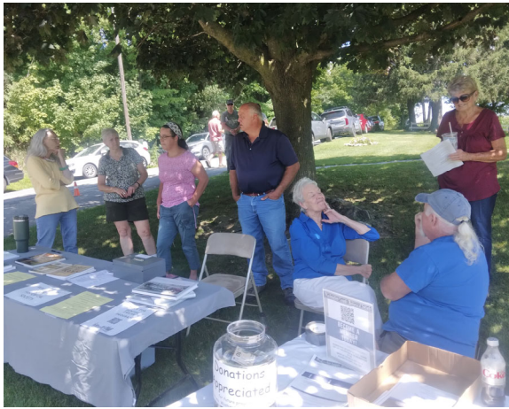
WCHS volunteers were ready to assist visitors.