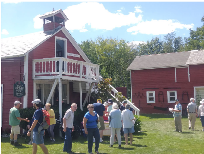
Enjoying the exhibits on a beautiful day.