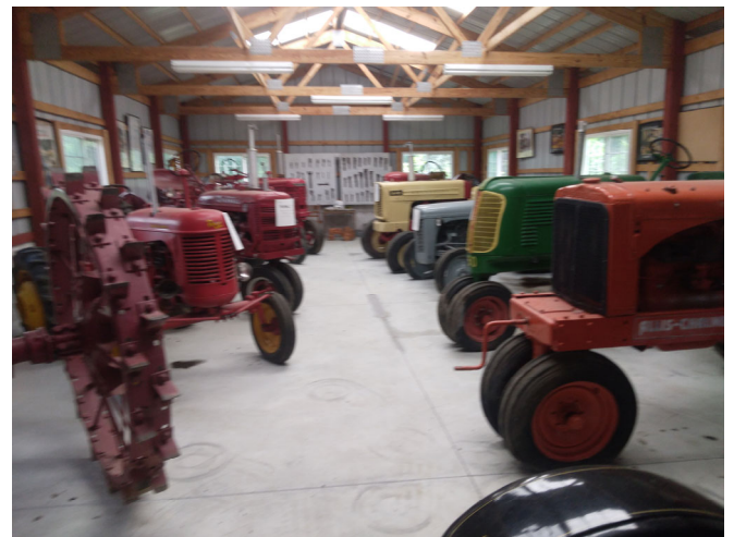
Antique tractors in one of the buildings.