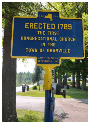
Before, and after—newly painted marker in Granville.